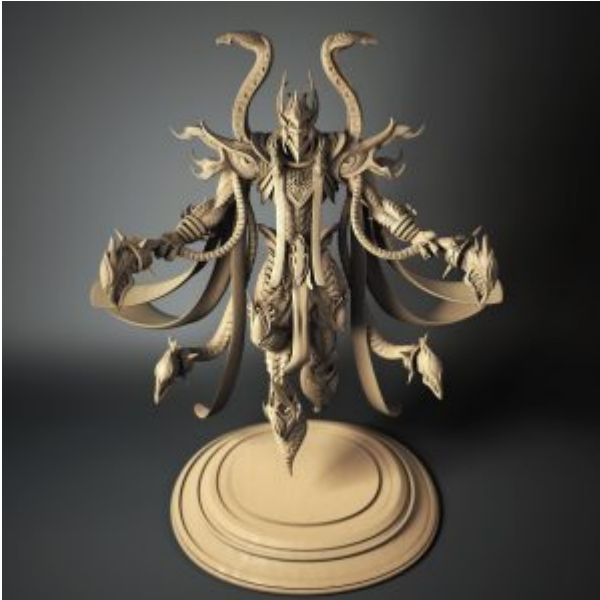
3-D computer rendering of an "archon"

Archon Eponymos was the primary magistrate, the Polemarch referred to the head of the armed forces, and the Archon Basileus was in charge of the religious aspects of society. Various fraternities and sororities use the title of archon or variations on it. Some Gnostic sects used this term for demons associated with the planetspheres.