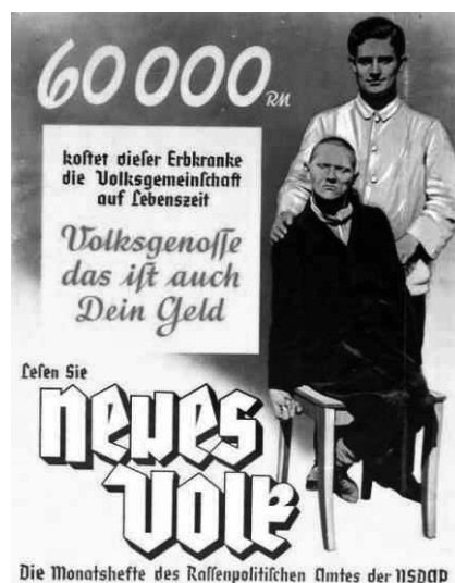
FIG 2 Nazi propaganda poster supporting the sterilisation or euthanasia of people with mental disabilities.

The text reads: 60 000 Reichsmarks is what this person suffering from a hereditary defect costs the People's community during his lifetime. Fellow citizen, that is your money too. Read New People , the monthly magazine of the Bureau for Race Politics of the NSDAP