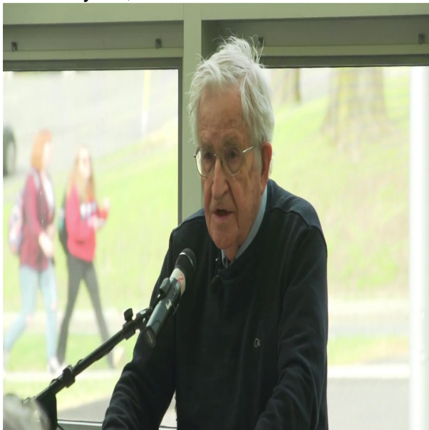
Noam Chomsky, "Neo-Liberalism: An Accounting"

This is the complete talk (excluding the Q&A) of Noam Chomsky speaking at Yale University on February 25, 1997